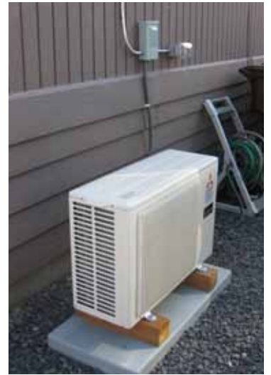
The indoor head of a ductless system sits high on a wall. The outdoor unit is more compact than a typical whole house air conditioner.