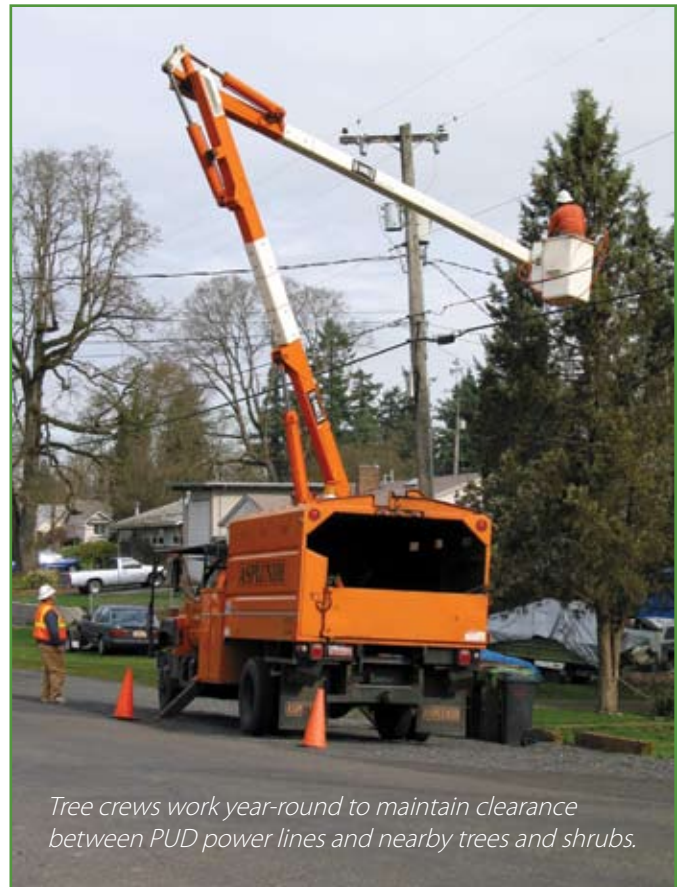
Tree crews work year-round to maintain clearance between PUD power lines and nearby trees and shrubs.

You may also make your request through our website. Visit www.crpud.net and click on "For Your Home".